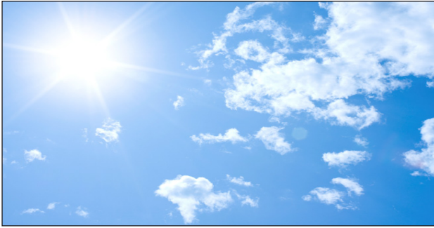
The Sun shines on the Earth