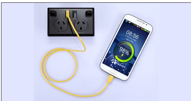
You plug your charger into a power point to charge your phone