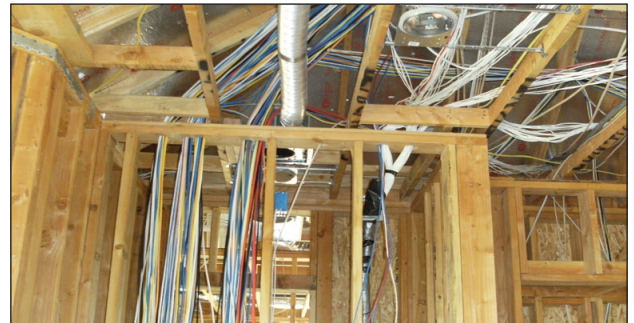
The electricity travels through cables in buildings to point of use