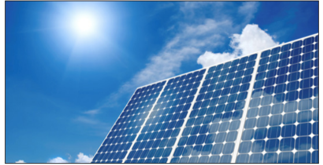
Solar panels transform light energy from the sun into electrical energy