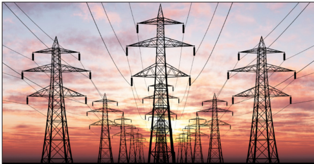
Electricity is transmitted along power lines to homes and buildings