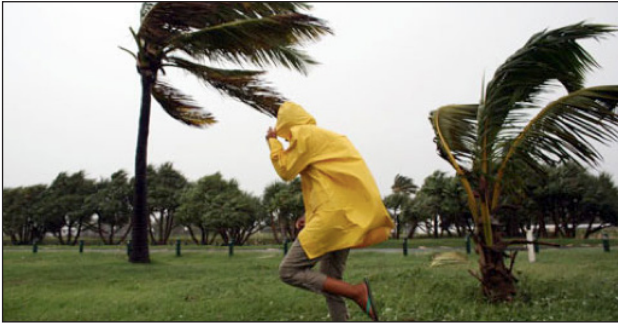
The wind blows