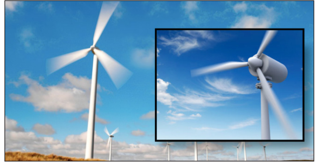
The energy of the wind pushes the blades of a turbine